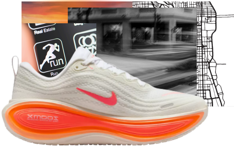
Vomero Plus Running Shoe, Nike

For mornings when disappearing into motion feels better than answering texts. Lightweight layers, slick hair, and a route that somehow always leads to coffee.