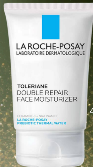
4. Double Repair Face Moisturizer LA ROCHE-POSAY