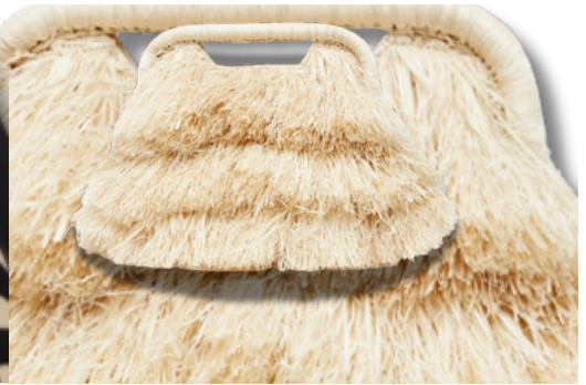
Fringe movement matters.