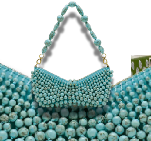
Beaded playful after dark.