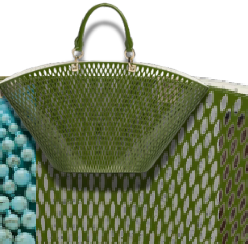
Mesh barely there.