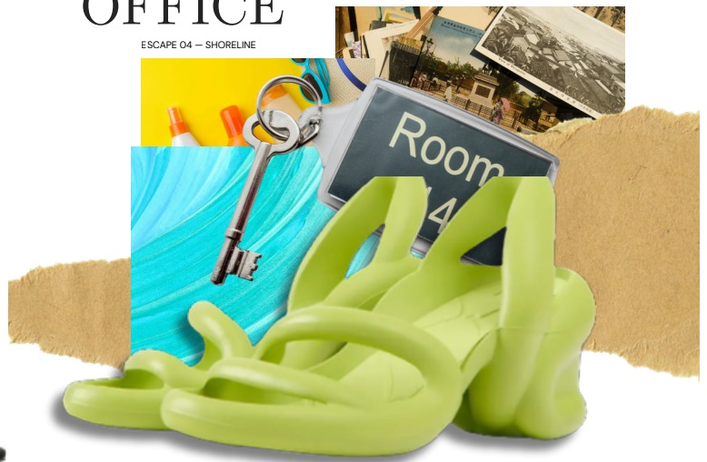
Slingback Sandal, Kobarah

Beach towel, oversized button-down, wet skin, paperback book.