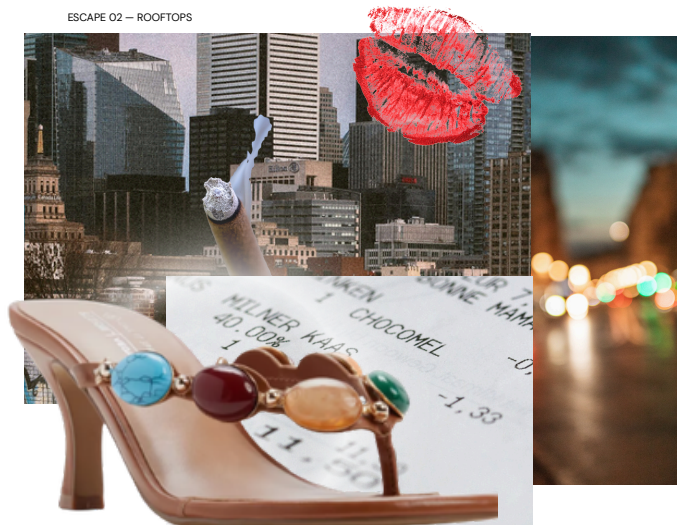
Call It Spring Thong Sandal, DSW

Barely-there heels built for warmth, louder laughter, and nights that were never meant to end early.