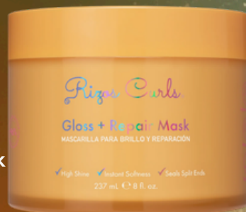
5. Gloss + Repair Mask RIZOS CURLS