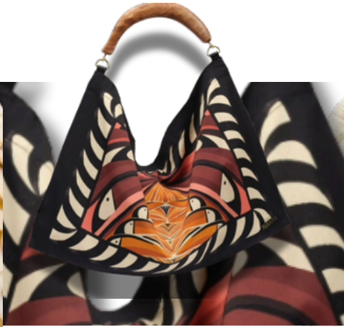
Silk Scarf Bag soft drama.