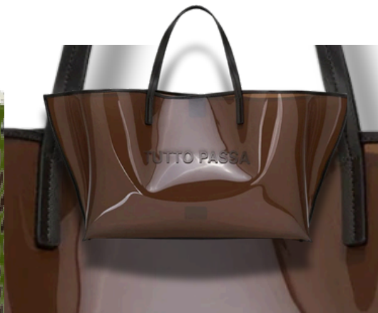
PVC glossed over.