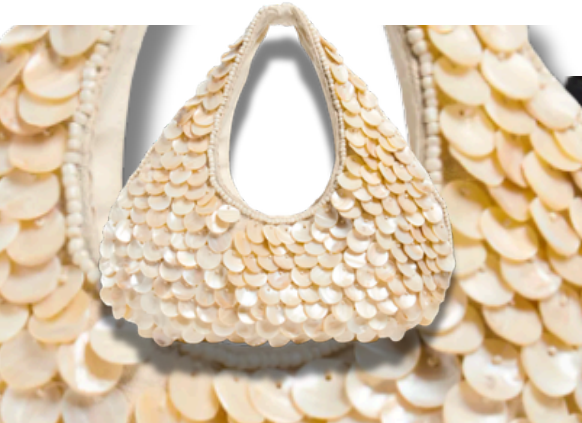
Seashell Hobo salt air energy.